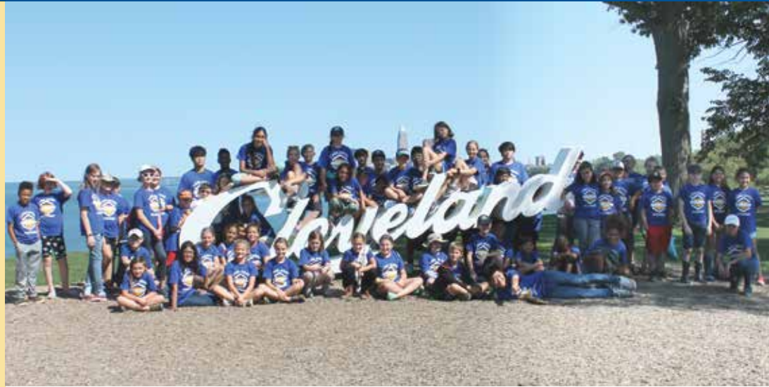
The fifth and sixth grade classes, along with their Upper School buddies, cleaned up Edgewater Beach and tested Lake Erie's water quality during the Year of Service Kick-Off Day.