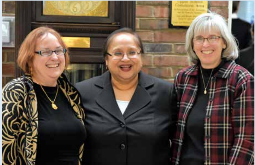
The Atticus Fund will support faculty professional development.